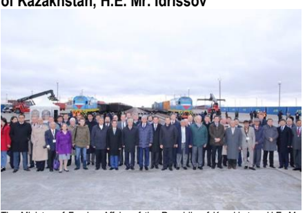
The Minister of Foreign Affairs of the Republic of Kazakhstan, H.E. Mr. Idrissov and Heads of Missions on the opening ceremony

Opening of East Gate Free Economic Zone by the Minister of Foreign Affairs of the Republic of Kazakhstan, H.E. Mr. Idrissov