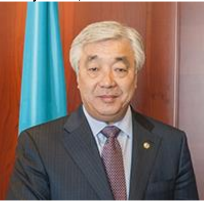
H.E. Mr. Erlan Idrissov, the Minister of Foreign Affairs of the Republic of Kazakhstan

A briefing on the nomination of Kazakhstan's candidacy for a non-permanent seat in the UN Security Council, MFA