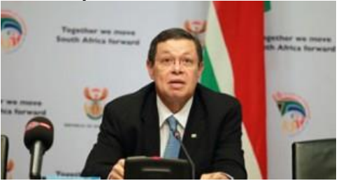
Deputy Minister of International Relations and Cooperation

South Africa always seeks mutually beneficial relationships in its international engagements, the writer says