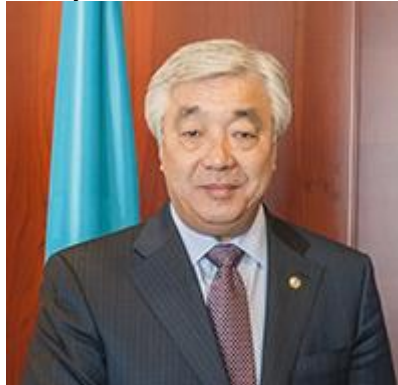
H.E. Mr. Erlan Idrissov, the Minister of Foreign Affairs of the Republic of Kazakhstan

A briefing on the nomination of Kazakhstan's candidacy for a non-permanent seat in the UN Security Council, MFA