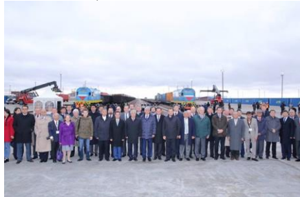
The Minister of Foreign Affairs of the Republic of Kazakhstan, H.E. Mr. Idrissov and Heads of Missions on the opening ceremony

On 19 October 2015 South African Ambassador HE Mr. S.Soni visited objects of the Khorgos – East Gate Free Economic Zone and the Khorgos International Centre for Boundary Cooperation. The tour was conducted with the participation of H.E. Mr. E. Idrissov, Minister of Foreign Affairs of the Republic of Kazakhstan and Mayor of the Almaty oblast Mr. A. Batalov.