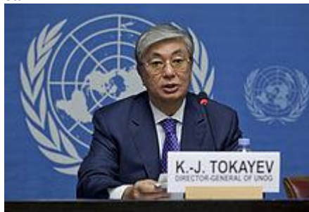
The Chairman of the Senate, Mr. Kassym-Zhomart Tokayev

70 th Anniversary of UN celebrated in Kazakhstan