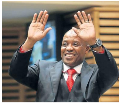
Eastern Cape Premier Phumulo Masualle

Premier Phumulo Masualle has been crowned as the Best Gender Focused Governor/Premier in Africa at a continental awards ceremony.