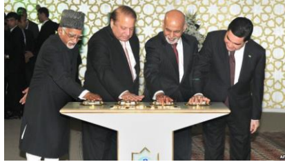
The TAPI launch ceremony was led jointly by President Gurbanguly Berdimuhamedov of Turkmenistan, President Ashraf Ghani of Afghanistan, Prime Minister Nawaz Sharif of Pakistan and Vice President Hamid Ansari of India

The Year of 2015 has been declared «The Year of Neutrality and Peace» by the decree of the Council of Elders of Turkmenistan. The adoption of a unique resolution by the United Nations General Assembly on 12 December 1995 has become the recognition of peaceful policy of Turkmenistan and its role as a country with ability to make a great contribution to pave a peaceful way for development of international relations.