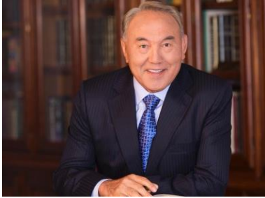
President of the Republic of Kazakhstan, H.E. Nursultan Nazarbayev