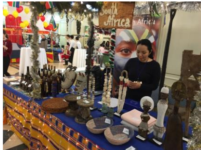
The stall of South African Embassy in Astana on the Charity Bazaar 2015

The seventh Annual Christmas Charity Bazaar was held on 6 December 2015 at the Radisson Hotel. All proceeds from the bazaar went to helping underprivileged children in the capital.