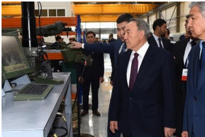
President Nursultan Nazarbayev on the opening of Paramount factory in Astana

Paramount Group, Africa's largest privately owned defence and aerospace business, announced a strategic collaboration with Kazakhstan Engineering Distribution to establish a manufacturing plant in Kazakhstan for the production of military armoured vehicles and civilian buses.