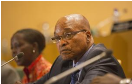
President of the Republic of South Africa, H.E. Mr. Jacob G. Zuma

H.E. President Jacob Zuma led a South African delegation to the 26th Ordinary Session of the Assembly of the African Union, held on 30 and 31 January 2016 in Addis Ababa. The Summit took place under the theme: "2016, African Year of Human Rights with a particular focus on Women Rights."