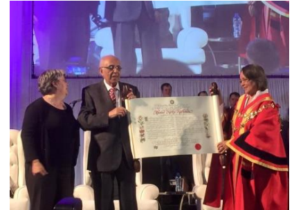
Ms. Barbara Hogan and Mr. Ahmed Kathrada

The event held by the City of Cape Town to confer the Freedom of the city award to Ahmed Kathrada was simple and dignified. Mayor De Lille delivered one of the best tributes to Kathrada. Well done to all the political parties in the Cape Town City Council and the Mayor for this immense honour that you bestowed onto someone who even on the day thought there were others more deserving of it than him.