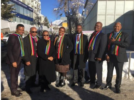
Team Presidency in Davos, supporting our President, Ministers and business leaders

Team South Africa on Saturday 23 January 2016 concluded a successful programme at the 2016 World Economic Forum in Davos, Switzerland. President Zuma, led a high powered Team South Africa delegation and delivered the message that South Africa is open for business to global investors and other stakeholders.