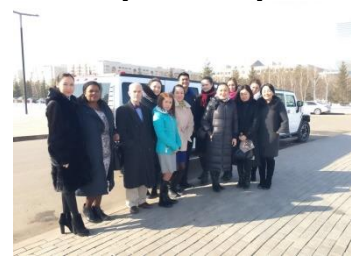
The ladies of the Embassy being spoiled by the Ambassador and the Counsellor