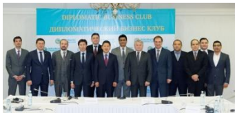
Ambassadors and business people

The first meeting of the Coordination Council of the Diplomatic Business Club held in Astana