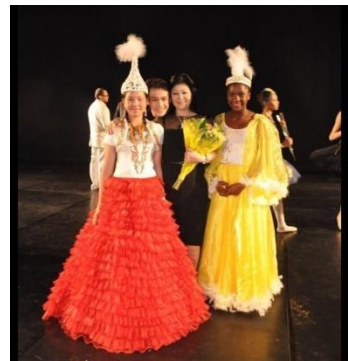
Girls in the Kazakh National Costumes