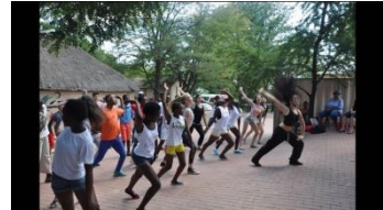
A master class by the Kazakh ballet teachers