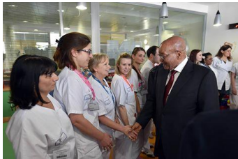
President Zuma greets staff at the oncology centre in Lyon, France.

The two leaders have been appointed by the UN Secretary General as co-chairs of the UN high level commission.