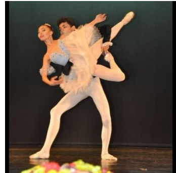
Performance in the capital's Breytenbach Theatre