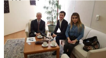
The Counsellor of the SA Embassy in Astana and journalists

On behalf of the South African Embassy, we would like to congratulate everybody most cordially on the occasion of the Nauryz celebrations! This day is always special for us, which brings a lot of fun and joy to everybody. May this day unite all people and bring a lot of wellbeing to our close people! May Nauryz bring a lot of success and harmony, prosperity and wealth, peace and happiness! May all our dreams and wishes come true! Happy Nauryz!